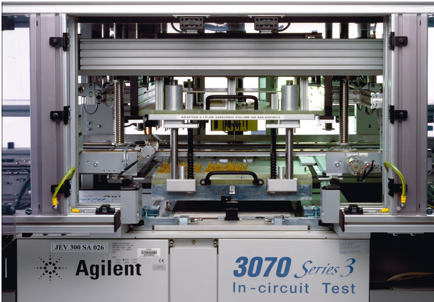
Test Handler Agilent 3070, Contact area with fixture

The communication between Test system and Test handler is via RS 232.