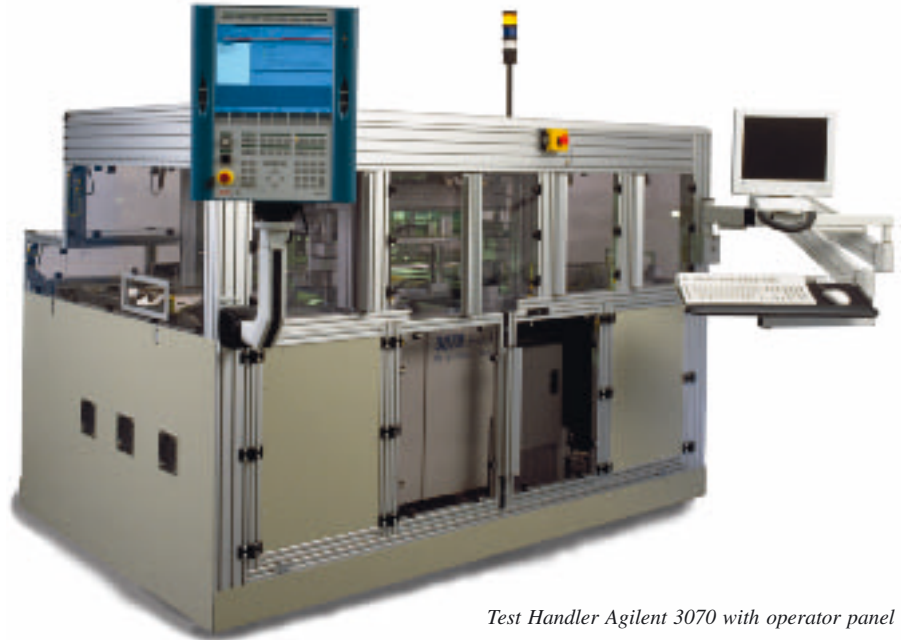
Test Handler Agilent 3070 with operator panel

After reading the barcode, the board moves into the contact area. The contacting unit consists of a four spindle servo drive.